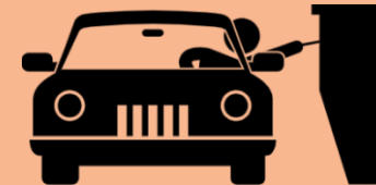
Car Park Access