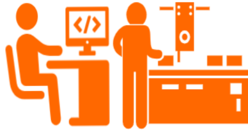
Manufacturer & Developer