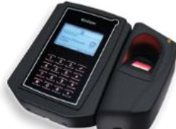
Multi-Format# & Fingerprint