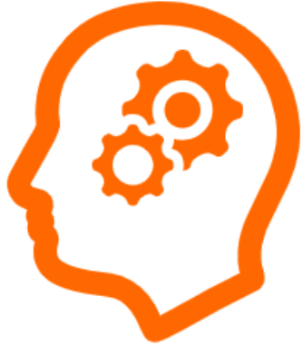
ISMS Solution Provider