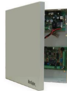
Encrypted IP DESFire (1/2/5) Door Controller