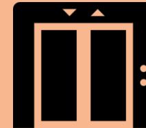
High Level Lift