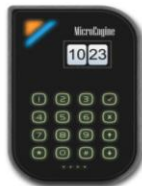
MIFARE/ CEPAS/ Proximity