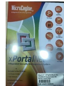
High Security System (Server & Client)