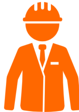
Partner Engineering Support