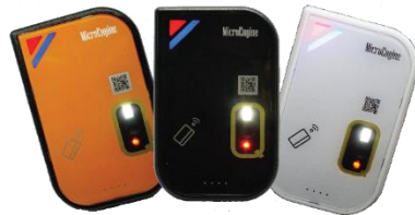
QR Code/ MIFARE/ CEPAS