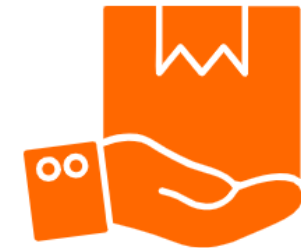
Minimum Lead Time